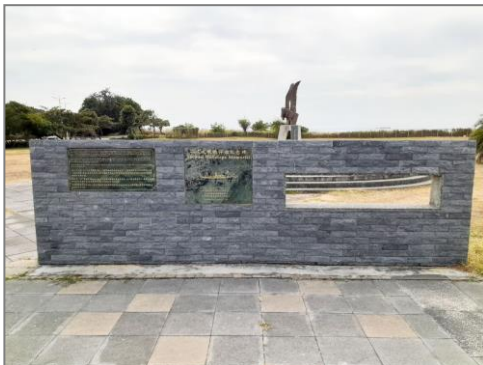
The Taiwan Hellships Memorial re-visited - December 4th.

The former burial ground for the men who died on the Enoura Maru today.