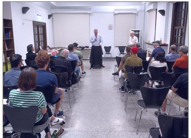
FEPOW Day celebrated - August 12th.