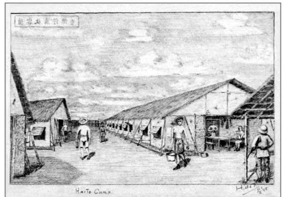
POW's drawing of Heito Camp in 1942.