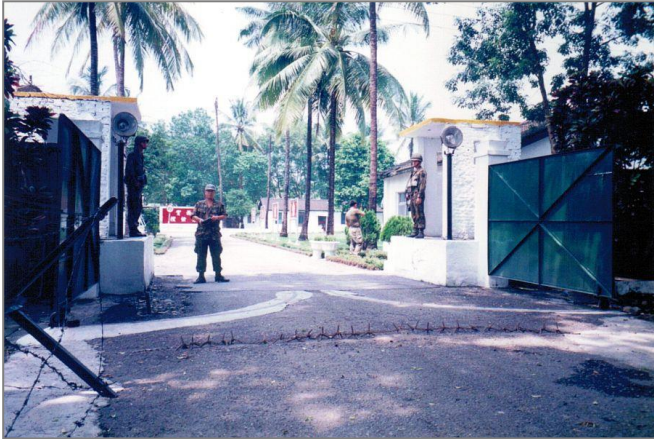
Entrance to Ai-Liao Army Base c.2000

It is also not completely certain what the small base was used for. Once our POW Society re-discovered the site of the camp in 1999 and began making visits, all that could be observed were groups of soldiers marching about on occasion. We enjoyed a welcoming, positive and friendly relationship with the base and its staff whenever we would visit the camp with former POWs and their family members from time to time and hold memorial services there.