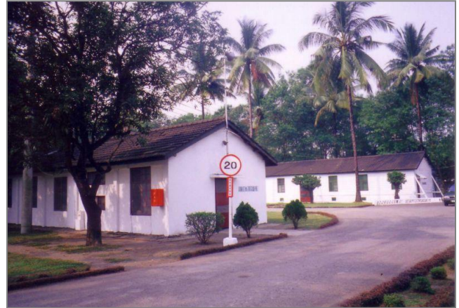
Dormitories for the soldiers in good condition.

Finally, in 2006 Ai-Liao Military Base was closed and the premises vacated. The property was taken over by the Pingtung County government who assured the Society that they would continue to take care of and preserve our POW Memorial which had been erected there in 2004 in perpetuity.