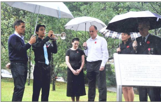
'Remembrance Week' event resumes following the end of covid restrictions.