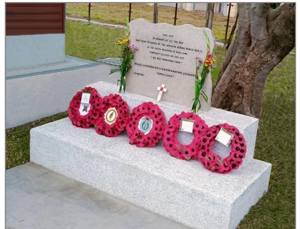
The new Heito POW Camp Memorial dedication service. (See pages 5 - 7)