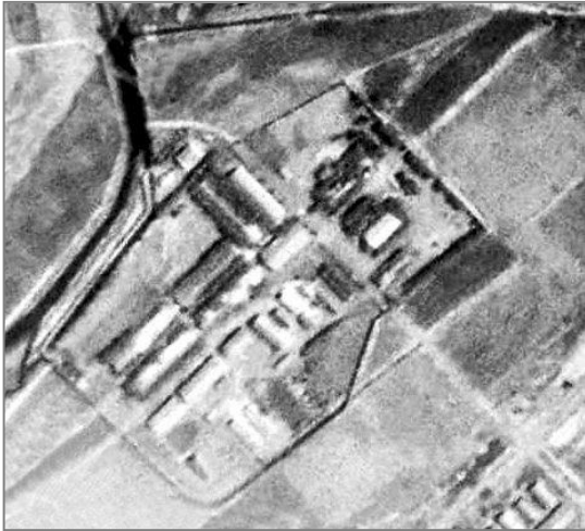
1944 USAAF aerial photo of Heito Camp.

In the late 1930's, a work camp was constructed of crude bamboo huts on the broad, treeless, dry plain near the present-day city of Pingtung to house mainly Chinese political prisoners of war who had been brought to Taiwan after capture on the mainland. The Japanese had previously dammed the Ai-Liao River for a hydro-electric project and the remaining river valley, strewn with rocks, boulders and stones, was being cleared to allow for the planting of sugar cane in the rich river bottom soil. The prisoners had to slave in the hot tropical sun at this task under poor conditions until July 1942.